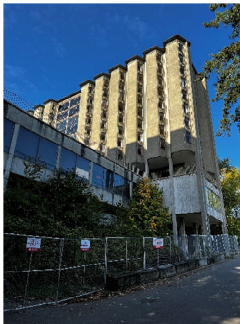
Site Fencing Install